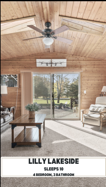
LILLY LAKESIDE SLEEPS 10 4 BEDROOM, 3 BATHROOM