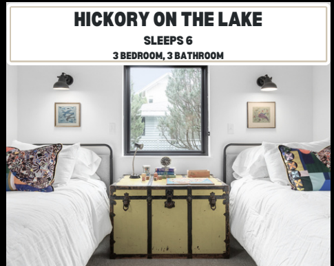
HICKORY ON THE LAKE SLEEPS 6 3 BEDROOM, 3 BATHROOM