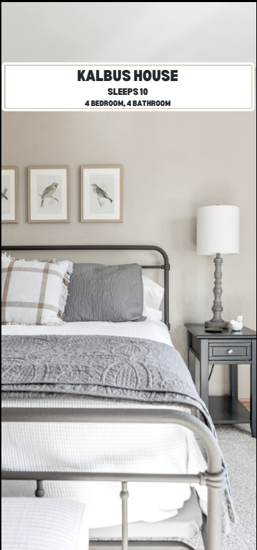
KALBUS HOUSE SLEEPS 10 4 BEDROOM, 4 BATHROOM