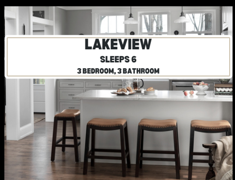
LAKEVIEW SLEEPS 6 3 BEDROOM, 3 BATHROOM