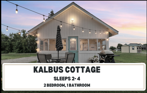
KALBUS COTTAGE SLEEPS 2-4 2 BEDROOM, 1 BATHROOM