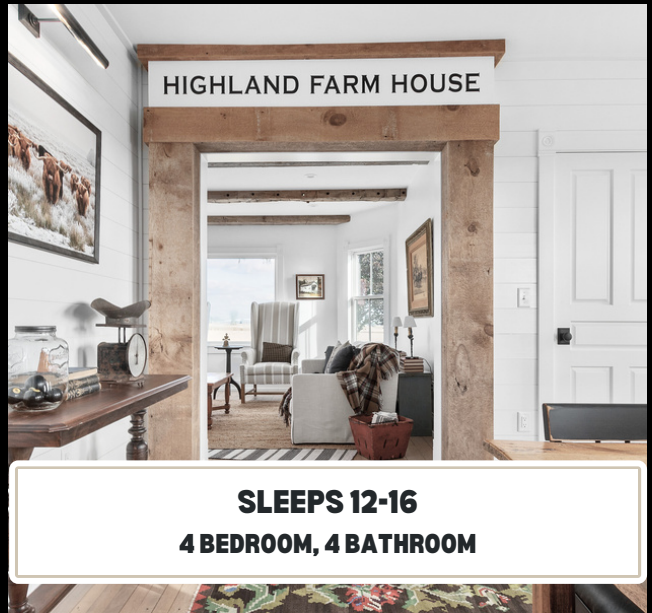
HIGHLAND FARM HOUSE