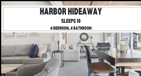
HARBOR HIDEAWAY SLEEPS 10 4 BEDROOM, 4 BATHROOM